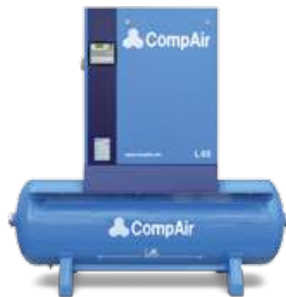
Receiver mounted compressor