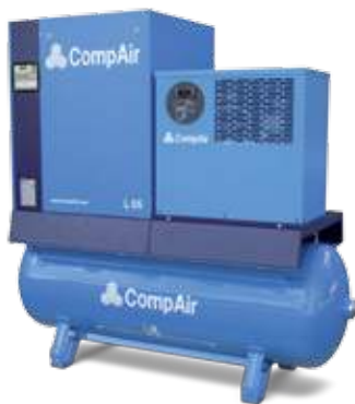
Complete airstation including compressor, dryer and receiver