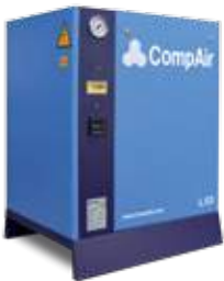
Compressor base mounted